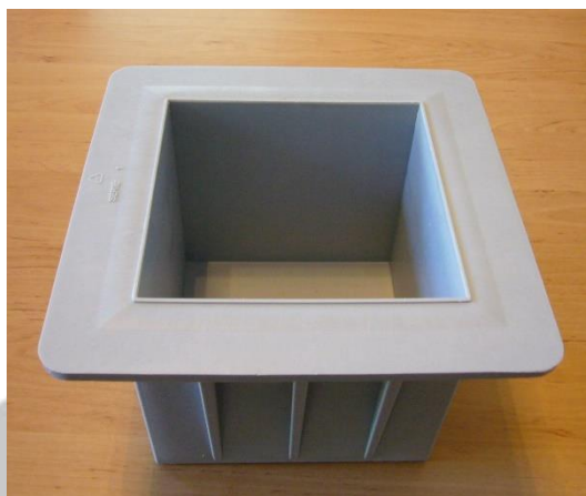
Full-plastic mould for cubes 150 mm /ZUM TEST/