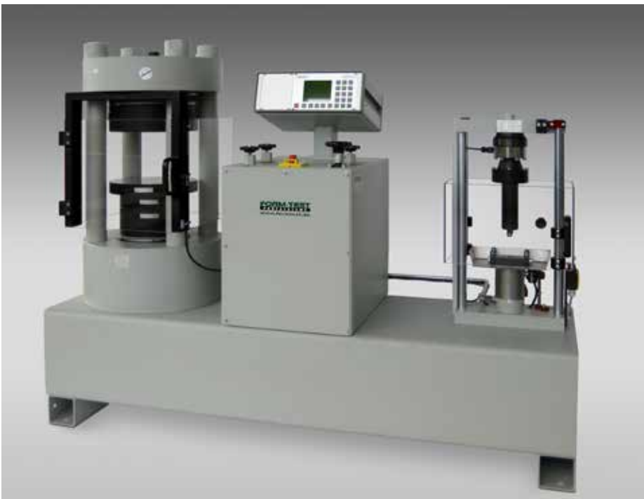
special construction with bending test for prisms (cement/mortar)